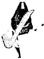
Plastic bottles (lids off), tubs, pots and trays