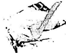
Newspapers, magazines and shredded paper