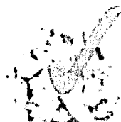
Foil, clean and crunched up