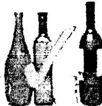
Glass bottles and jars (lids off)