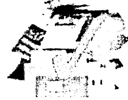
Paper, envelopes and phone directories