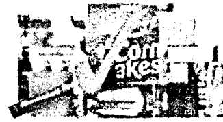
Cardboard, greeting cards and wrapping paper (without foil or glitter)